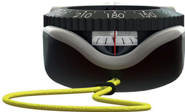
Item n° V-FINDER