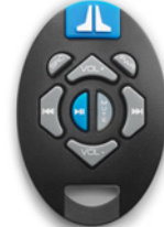
MMR-10W Wireless Remote Wireless, key-fob style remote