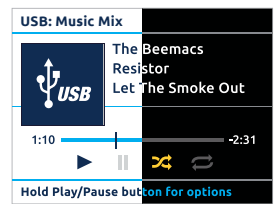
▲ Display Theme 2, optimized for Night Mode ▲