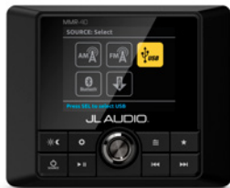
MMR-40 NMEA 2000® Network Controller Full-function remote with LCD display