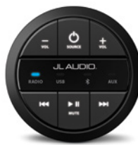
MMR-20-BE Wired Remote Controller Wired, non-display remote