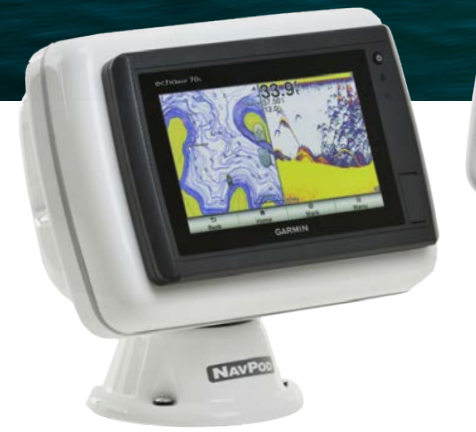
PowerPod PP4400 Series for popular 7 inch displays