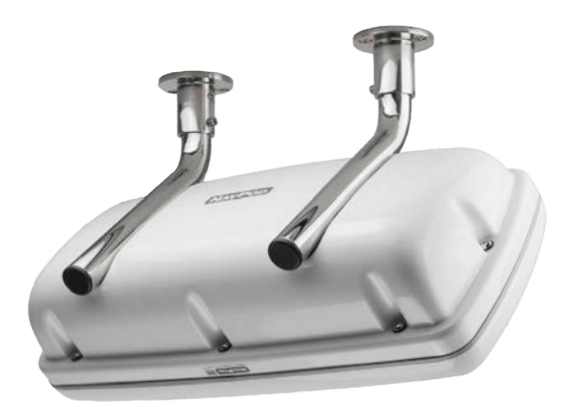
Shown: GP1040 SystemPod on SK129 Stanchion Kit. (Back shot of photo on left)

SystemPods are for mounting multiple pieces of electronics into a single NavPod. A Radar or Chartplotter can easily be mounted along side Autopilot or Instrument displays.