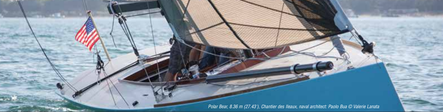
Polar Bear, 8.36 m (27.43'), Chantier des Ilesaux, naval architect: Paolo Bua